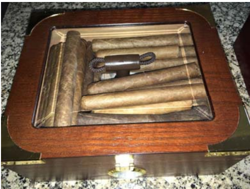
HumiForm™ 50 V with 49 mixed size cigars in 50-count humidor

Imagine Refilling Your Humidor Only Once or Twice a Year.