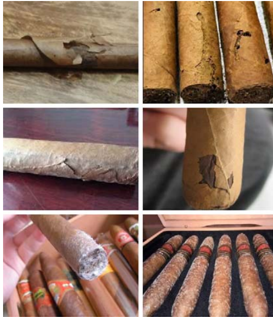
Damaged Cigars from Too Much or Too Little Humidity